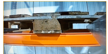
Entering the pallet with the GripView