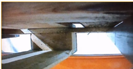
Picking up the pallet with the GripView