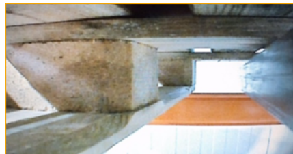
Picking up the pallet with the market standard