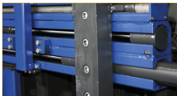
V2A compression spring (no gas pressure cylinders)